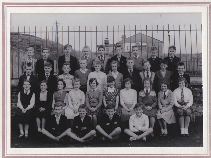
MUIRKIRK J. S. SCHOOL, 1961.