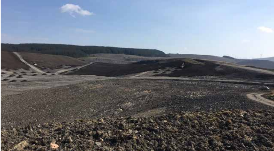
Plate 1: Soiling operations, Area A, Ponesk, with Grasshill Forest to the rear

At Ponesk work continues on program with the relatively mild Winter contributing to maintaining progress. Land to the west of Ponesk Burn is now re-profiled and soiled, with moorland grass seed being sown. Muckshift continues on the eastern side of the Burn, with soil and compost mix also being spread. Further re-shaping of the overburden will take place in the Grasshill area through the Summer months. Importations of compost (donated free-of-charge by GP Landscapes) have greatly assisted in making good soils shortfalls and we continue to explore opportunities to enhance growth medium wherever we can.