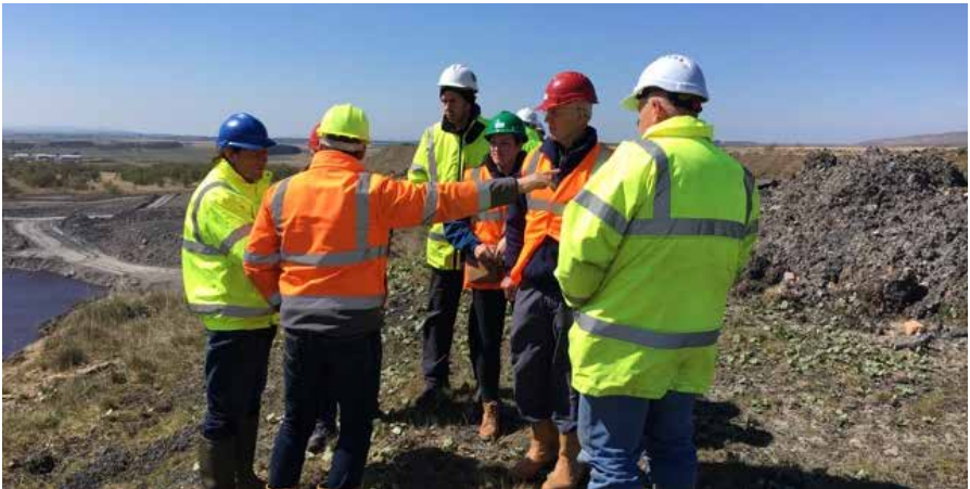
Plate 2: Site staff explain Powharnal operations to representatives of EAC & Muirkirk CC

To the west of Muirkirk SMRT is heavily engaged on the Powharnal site. At the time of writing it is understood that a report recommending planning approval for our revised restoration strategy (in association with remediation and mitigation works on the Muirkirk & N Lowther SPA) is to go forward to the Council for approval. The proposals are in line with those presented to the community at the various pre-application meetings and the Trust is grateful for the positive comments received from the local community and which helped to shape our submission. In the interim MRL has progressed various works in line with the current planning permission (mainly the recovery of soils and peat), but has also dealt with earlier breaches of planning control by the previous owners. To this end the Gasswater Mound has been re-profiled (see photo below), as has the former Dalfad Amenity Area. Various fencing operations are also in hand, assisting with grazing management in the vicinity. Moorland management work has also been on-going to aid the SPA mitigation works. This has seen our specialist advisers undertake detailed survey work across Airds Moss and on the moorland south of the site, whilst also assessing ecological issues affecting land at Dalfad and on Marchhousehill.